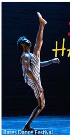
Bates Dance Festival