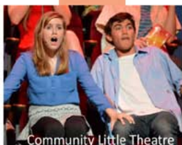
Community Little Theatre