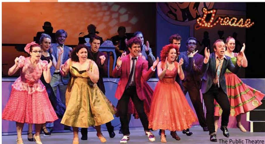
The Public Theatre