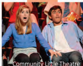
Community Little Theatre