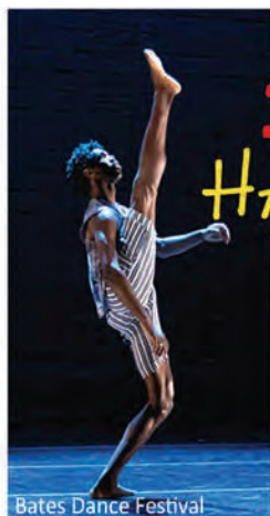
Bates Dance Festival