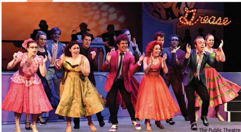
The Public Theatre